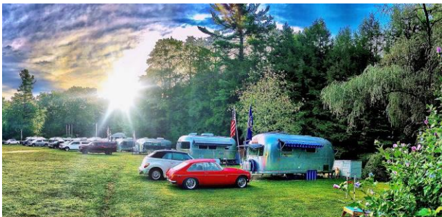
June 2021