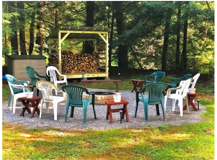
Newly Expanded Penn Wood Fire Pit Area